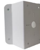
DS-1276ZJ Corner Mount